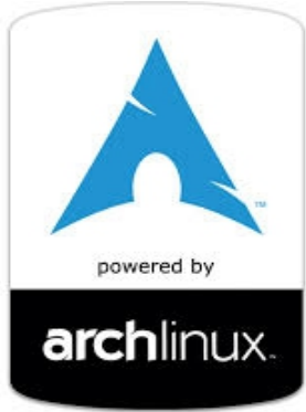
Distribuzione ARCH Linux